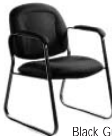
Black Guest Chair