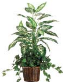
Dieffenbachia/ Ivy Planter