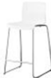
White Blixt Bar Stool