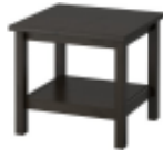
Black End Table