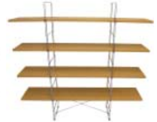
Wire & Wood Shelf