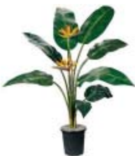
Bird of Paradise