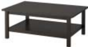
Black Coffee Table